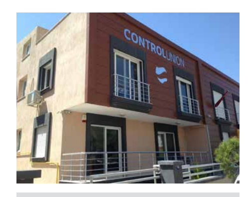
CONTROL UNION TEKSTILE LABOROTORIES ISTANBUL