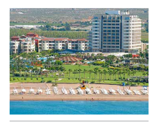
LARA BARUT COLLECTION HOTEL ANTALYA