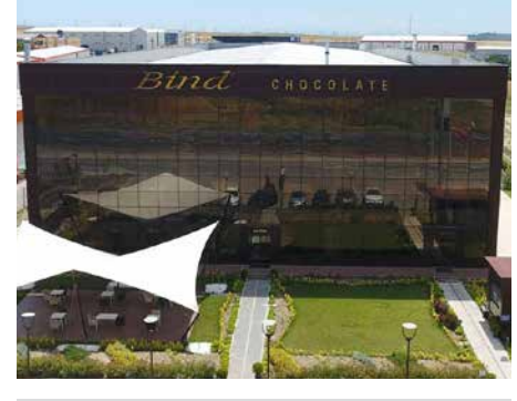
BIND CHOCOLATE FACTORY TEKIRDAG