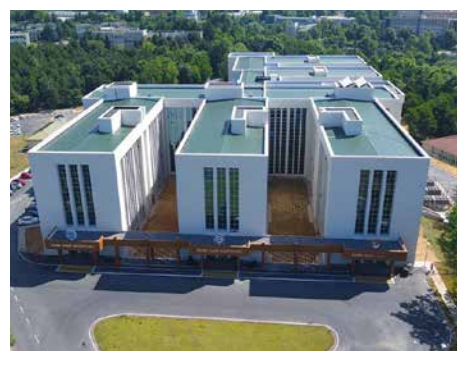
MSU NATIONAL DEFENSE UNIVERSITY INFORMATION CENTER (LIBRARY) - ISTANBUL