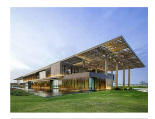
SENEGAL DATA CENTER SENEGAL