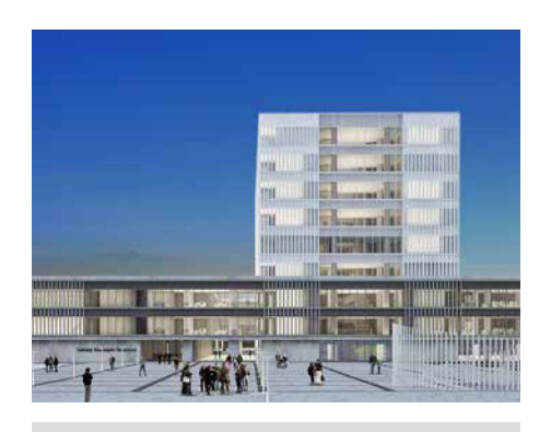
TEKIRDAG METROPOLITAN MUNICIPALITY BUILDING - TEKIRDAG