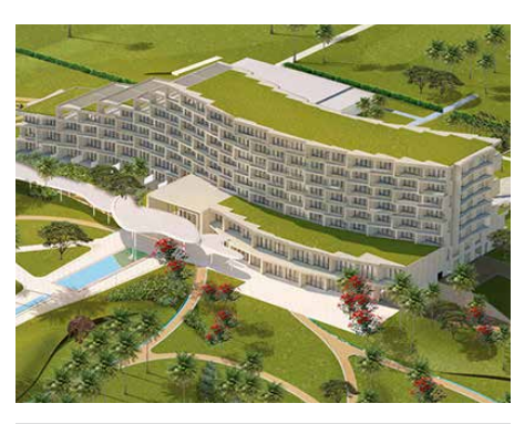
SOFITEL HOTEL & CONGRE CENTER BENIN