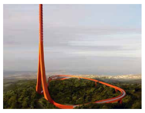
CANAKKALE TERRESTRIAL DIGITAL BROADCAST TOWER - CANAKKALE